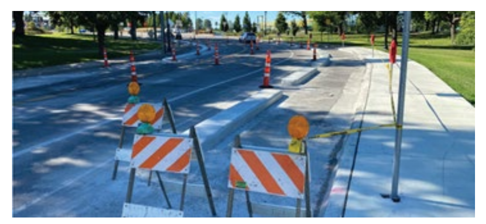
In-Street Curb-Protected Bike Lanes on Oak Grove St

In-street concrete curb protected bike lanes utilize a form-in-place concrete curb installed on the roadway surface to provide physical separation from motorized traffic. Form-in-place concrete curbs provide numerous advantages over bollard-delineated bikeways, including reduced annual maintenance costs and reduced vehicular encroachment into the bike lanes. They are typically implemented as an upgrade to non-protected or delineator-protected bike lanes. The considerations in this section build on the guidance for delineator-protected bike lanes, which should serve as the starting point for any in-street curb-protected bikeway.